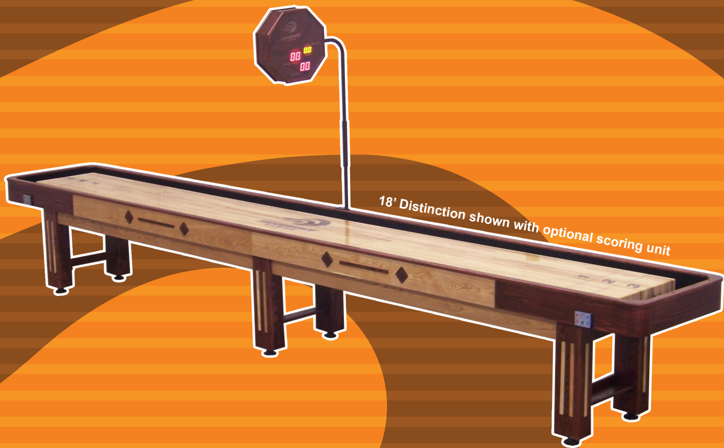
18' Distinction shown with optional scoring unit